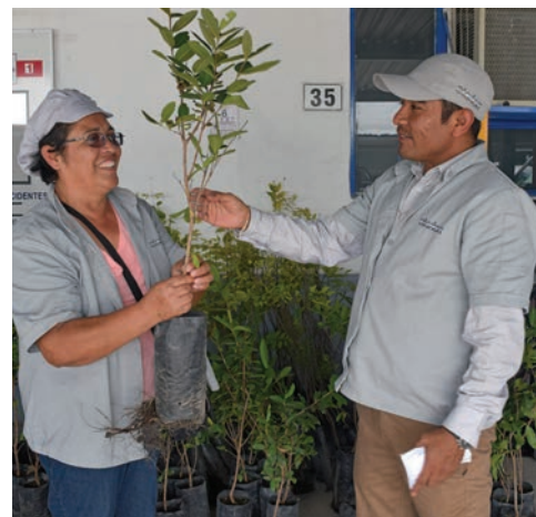
Top: Clothing and blanket drive organized to support families in the local community.